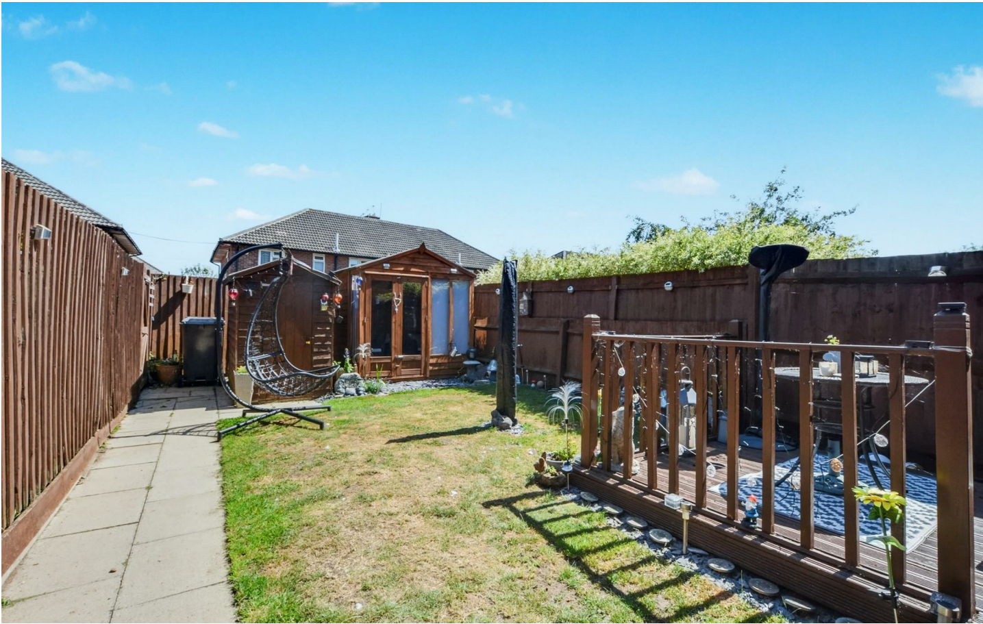
A TWO BEDROOM PROPERTY FOUND IN A CUL-DE-SAC LOCATION.

Robert Ellis are delighted to offer to the market a wonderful opportunity to purchase a 25% SHARED OWNERSHIP property within Sawley. Situated in a quiet cul de sac, the property is ideal for a first time buyer, offering two bedrooms and great sized living accommodation to the ground floor including a spacious kitchen diner and downstairs WC. The property is ideally positioned for local shops and amenities including local bus routes. Also great access for link roads such as the A50 and M1 are within easy access.